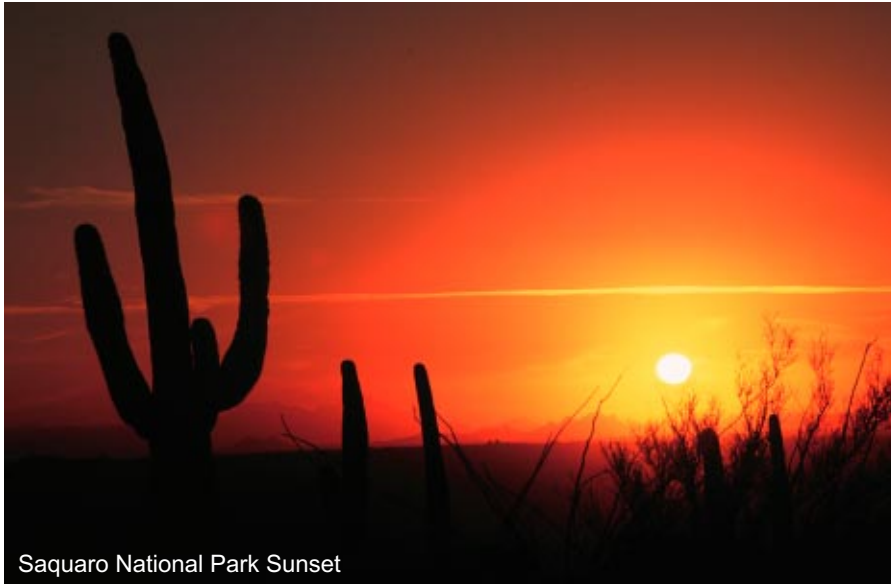
Saquaro National Park Sunset

The majority of my photography is done during the first couple of hours in the morning and the last couple of hours in the late afternoon. With the sun at this low angle the